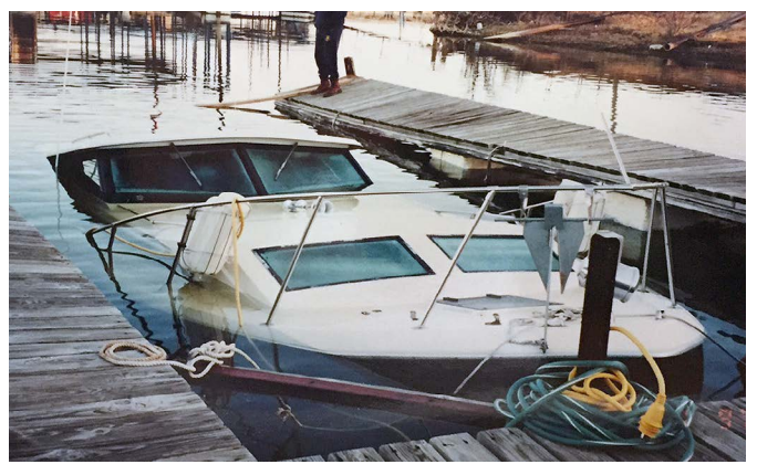
The time to ensure you have the right boat insurance coverage – and understand what it does and doesn't cover – is before you need it.

underwater rock or floating log, or running into another boat. In fact, the first seven items on the GEICO | BoatU.S. Marine Insurance list can involve salvage. Reason enough to be sure you understand how that would be handled under your policy.