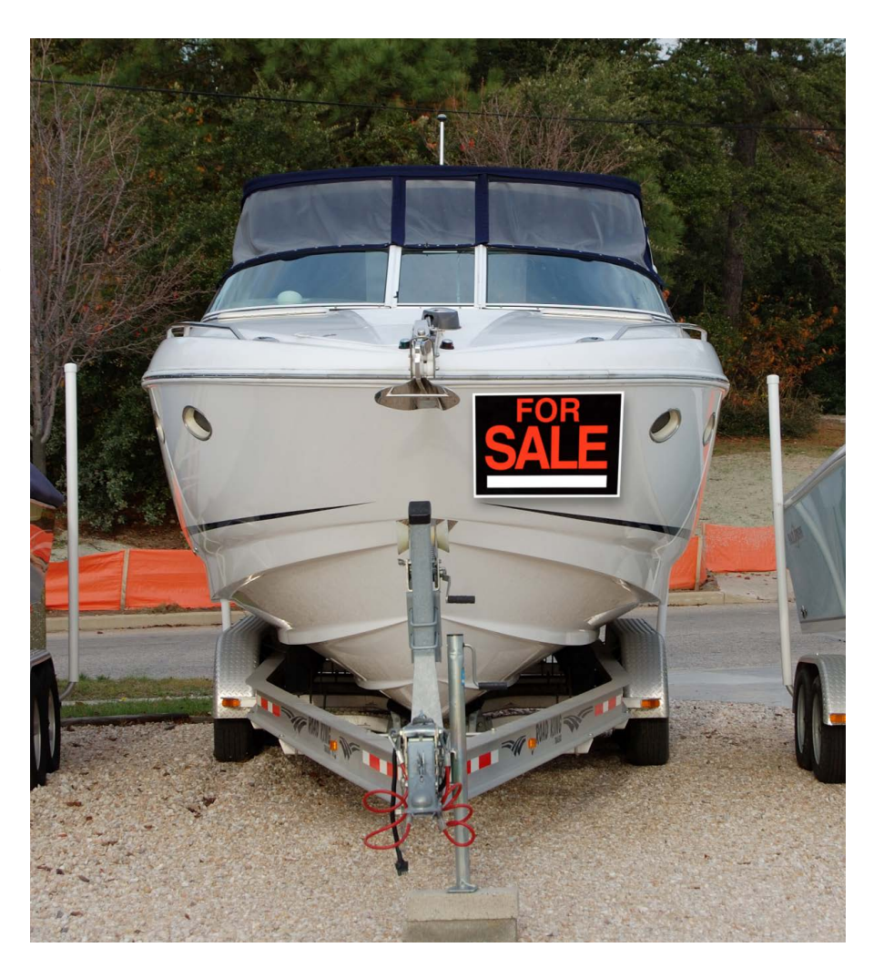
Buying a used boat? Make sure all the terms of the sale are spelled out in a sales contract, which you can download from the BoatU.S. website if the seller doesn't have one.

You can, however, enter into an agreement with a broker through a buyer's broker arrangement. A buyer's broker will represent you, not the seller. Once he knows what you're looking for, he can scour his sources and suggest likely boats for you to view, assist in negotiating a price, and help with the paperwork. Typically, a buyer's broker gets a commission split from the seller's broker so